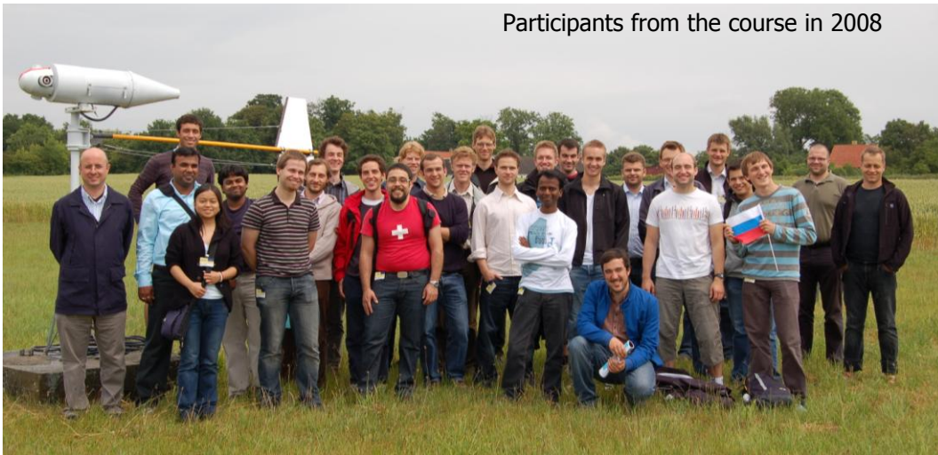
Participants from the course in 2008

Accommodation can be arranged either at the Risø DTU's Guest House for the cost of 260 DKK per night, please notice that there is a limited amount of rooms available there. The participants can also arrange to stay in hotels or hostels, e.g. Hotel Prindsen in central Roskilde www.hotelprindsen.dk or Roskilde Hostel www.rova.dk .